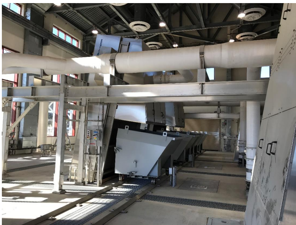
Back River WWTP Headworks Project – Coarse Screens Facility; December 2020