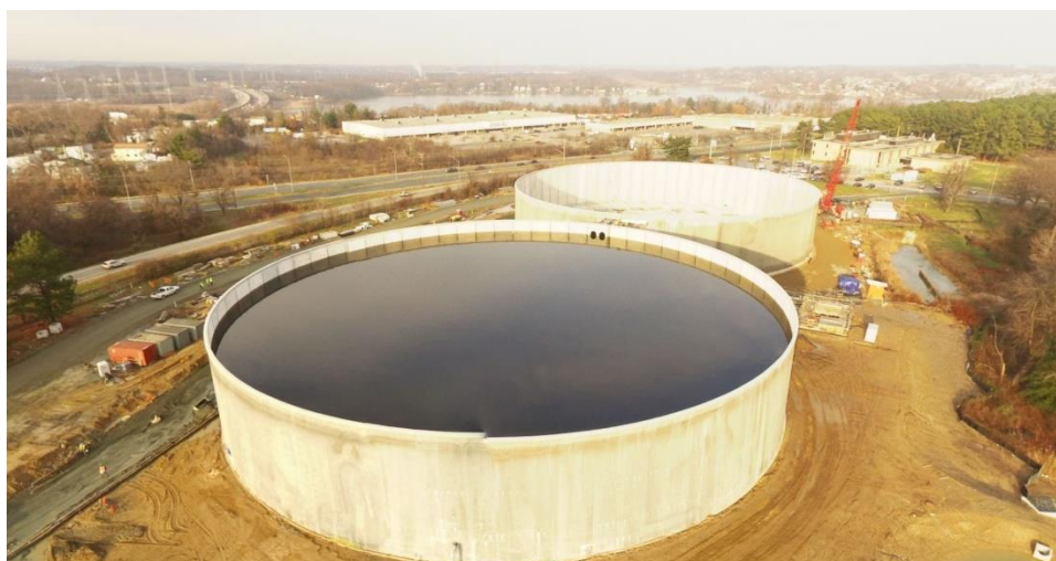
Back River WWTP Headworks Project – EQ Tanks; December 2020