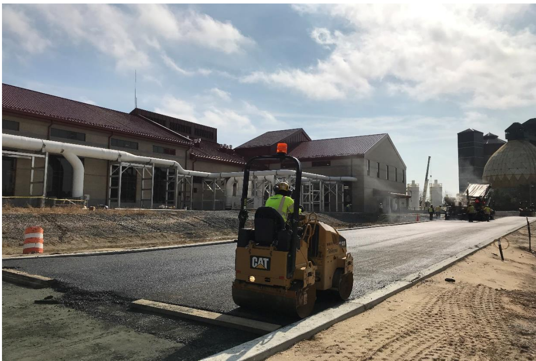
Back River WWTP Headworks Project – Site Work; October 2020