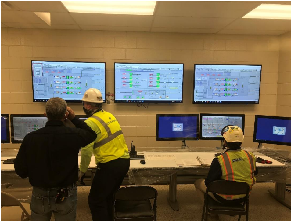
Back River WWTP Headworks Project – Control Room; November 2020