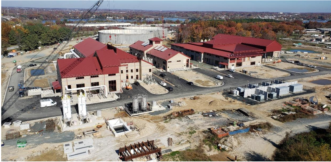
Back River WWTP Headworks Project - Progress Photo; December 2020