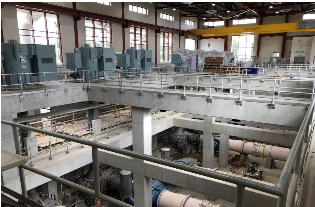
Back River WWTP Headworks Project – IPS Pumps; November 2020