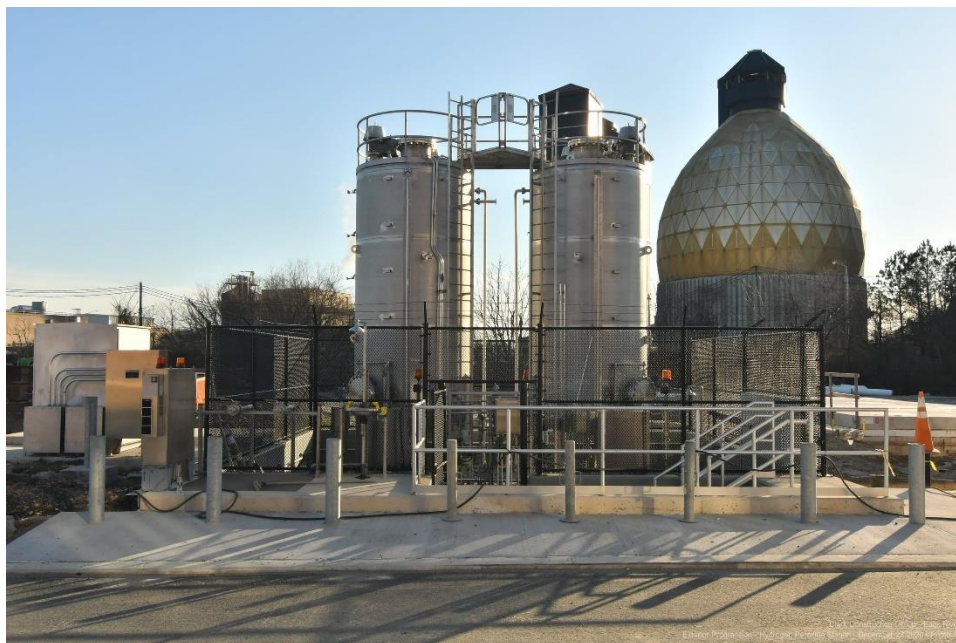
Back River WWTP Headworks Project – H2O2 Facility; December 2020