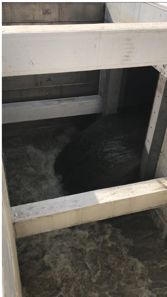
Back River WWTP Headworks Project- Free Discharge; November 2020